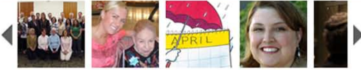
Campaign leaders from all over the state gathered at the Lucille Goodrich Department of Corrections Headquarters building in Tumwater for the Combined Fund Drive's annual training event.